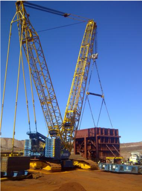
CC 2800-1 Crawler Crane in Chichester