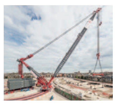
ALE has finished using its AL.SK190 crane at Earls Court in London, UK, where it says it lifted a beam weighing 1,500 tonnes - the largest single lift undertaken in UK history

ALE also launched the Zezelj bridge in Novi Sad, Serbia, in October 2017. In total the bridge weighed 11,100 tonnes and was 474 m long. ALE was contracted by Spanish civil engineering and construction services company Azvi to perform the bridge launch. The project started in June 2017 and involved jacking as well as launching two arches and the installation of two span sections.