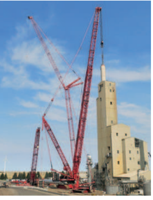
Mammoet used its Liebherr LR 11350 for an R-101 vessel replacement job in Southern Alberta, Canada

Impressive heavy lifts are continually being conducted around the world, CHRISTIAN SHELTON reports on trends and interesting projects in the sector