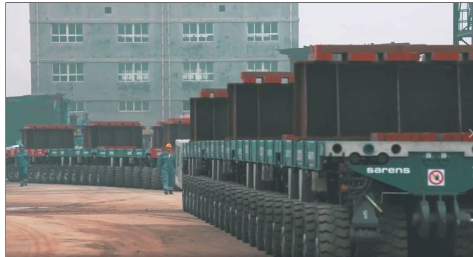
Sarens-Sinotrans JV (SSJV) was awarded the contract for the Load-out of modules for the Yamal LNG project for PJOE.

Pengtai Jutal Offshore Engineering Heavy Industries (PJOE) is a globally operating upstream fabricator which specializes in the fabrication of large and complex structures for the upstream industry for oil and gas, mining, desalination, energy and related activities. PJOE won part of the construction and mobilization contract for Yamal LNG project, based in Yamal peninsula in Northern Russia. Awarded in 2014, the Yamal LNG project will comprise three liquefaction trains of 5.5 million tons per year that are among the world's largest.