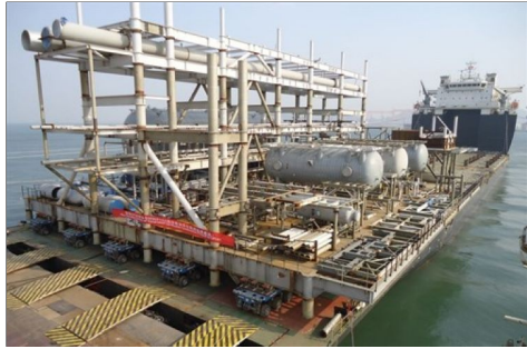
Video: Yamal LNG Module load-out by Sarens-Sinotrans