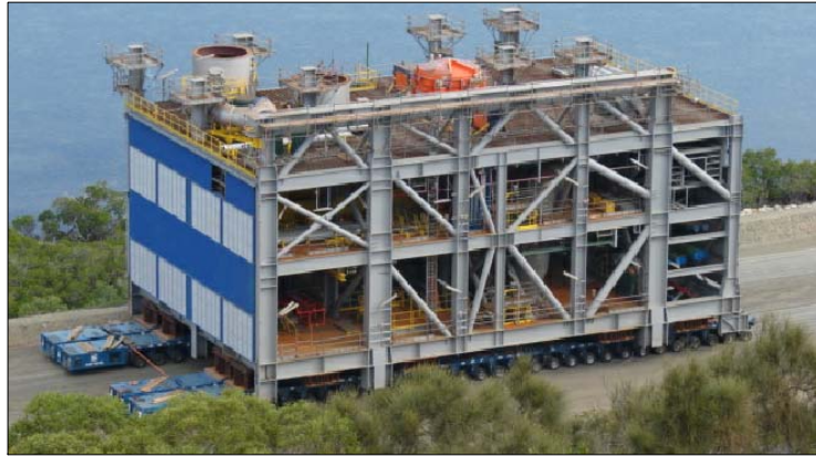
Client: Hatch - Technip Location: Koniambo - New Caledonia Weight: 3900 T