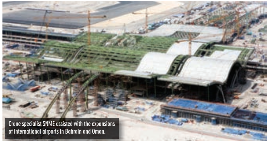
Crane specialist SNME assisted with the expansions of international airports in Bahrain and Oman.

Belgium-headquartered Sarens is one major heavy lift player seemingly unperturbed by the Middle East’s current economic challenges. In fact, the company’s joint-venture with Bahrain-based NASS Group appears to be going from strength to