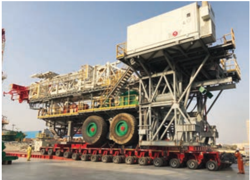
Khimji Ramdas recently handled the transport of a rig and accessories, totalling 7,700 cu m, from Dubai to Oman.

For example, work has commenced on Bluewaters Island and the Dubai Eye – the