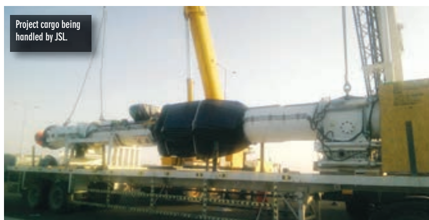
Project cargo being handled by JSL.

In September, Bahri officially inaugurated its joint venture with French 3PL Bolloré. Ali al-Harbi, Bahri chief executive, said BahriBolloré Logistics would enable it to play a significant role in raising Saudi Arabia’s “ranking in the global logistics market”, which is an important objective of Vision 2030.