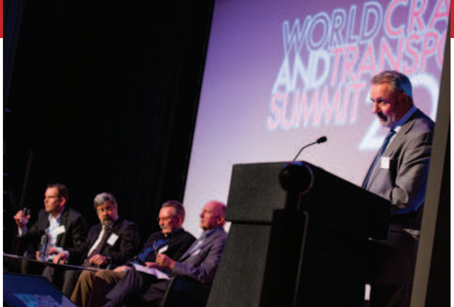
There was lively discussion during the question and answer session on multiple crane lifts