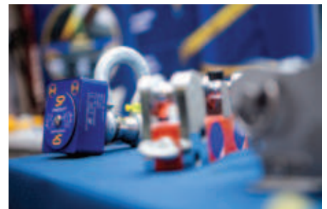
Event sponsors had the opportunity to present their products and services throughout the event

See www.khl.com , ICST and KHL social media channels for more photos, videos and news about this conference and the next one.