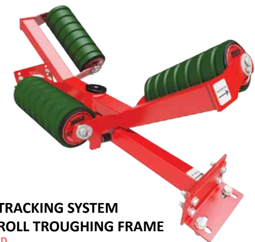
BELT TRACKING SYSTEM 3 / 5 ROLL TROUGHING FRAME PATENTED