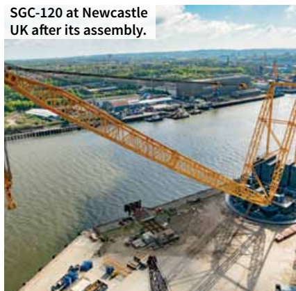
SGC-120 at Newcastle UK after its assembly.

the machinery deck can hold six power pack units, eight winches and of course, the operator's cab."