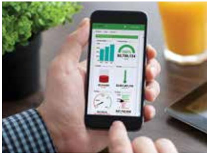
Designed by and for construction professionals, Construction Viz has all the features needed to manage projects.