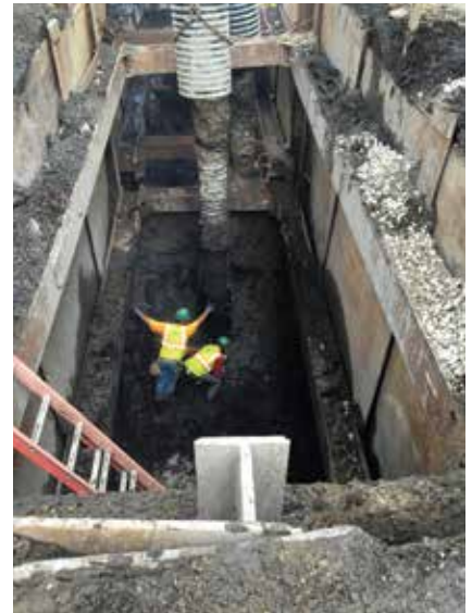
Drivecast pile provides a deep foundation solution that is cost effective and eliminates spoils and vibration during installation.

At the end of the day, this innovative game changer provides a displacement pile that yields a large grout column and high lateral, axial and tensile capacities not realized with even the most robust antiquated pile technology.