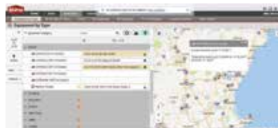
A unified software platform allows for a more holistic approach to equipment maintenance and management.

Integrating telematics and GPS capabilities completes the picture, allowing contractors to deliver vital data about equipment location and performance directly and automatically to their software platform. ♦