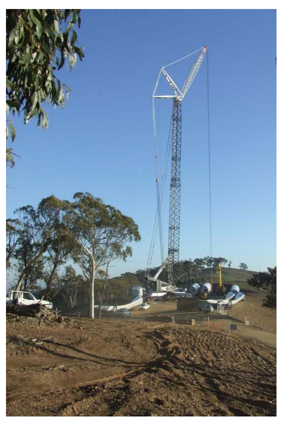
Repower – Australia