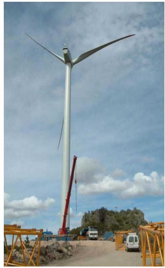
Repower Teixero – Portugal MM82 / 100m