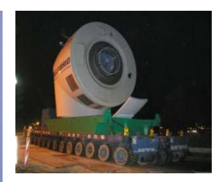
Multibrid Bremerhaven M5000