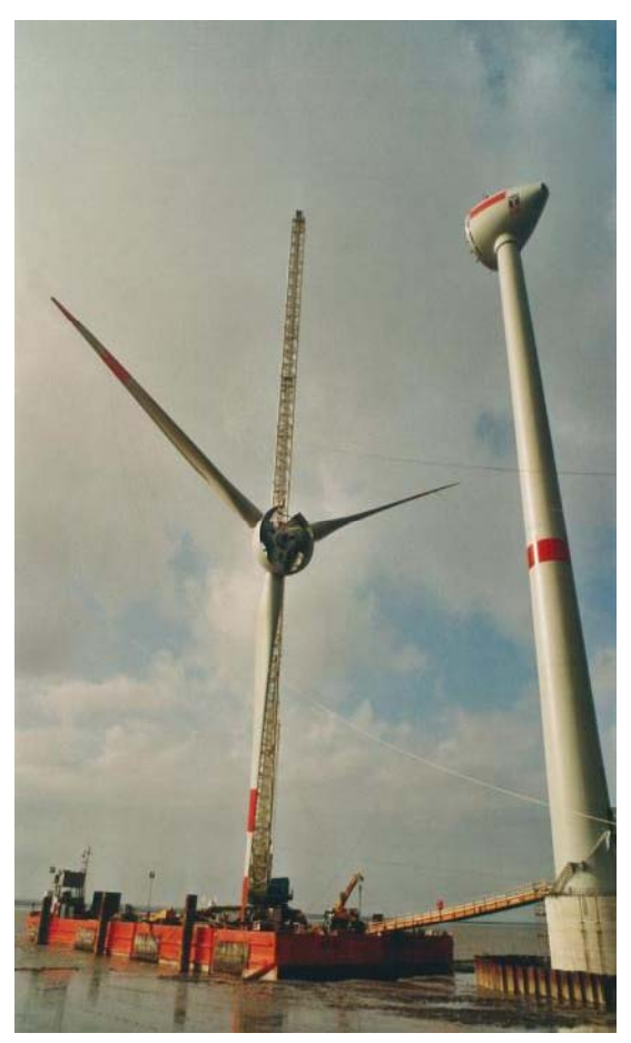
Enercon Emden – Germany E112 turbine – 120m