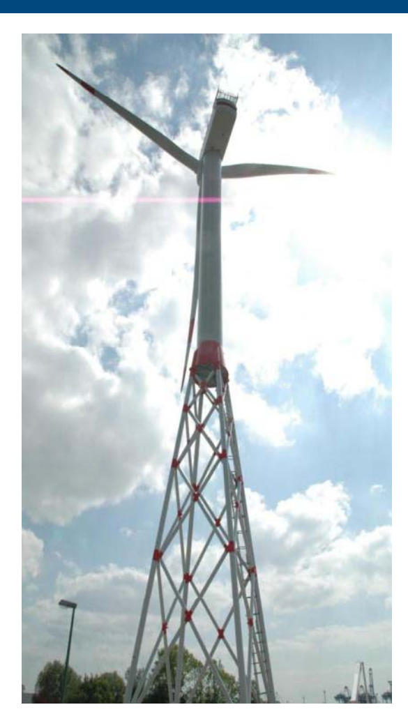
REpower Proto type