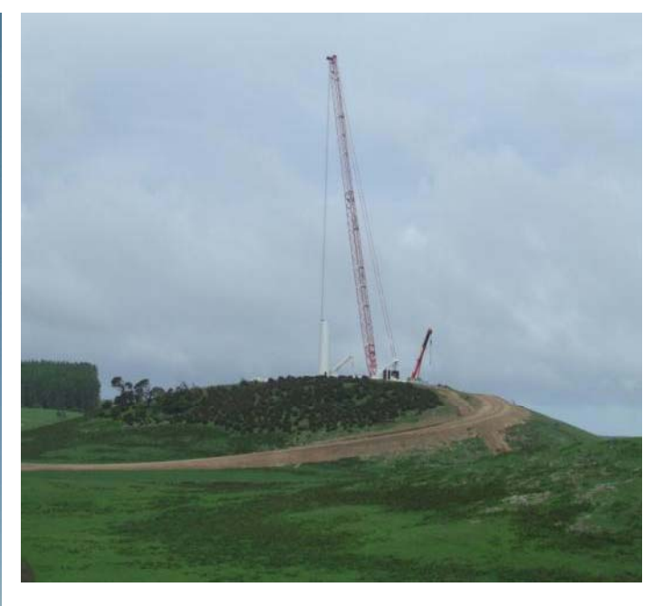
Vestas – Lake Bonny Australia