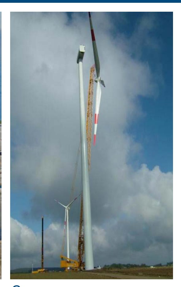
Gamesa Kugelberg – Germany G80 / 100m nothing too heavy, nothing too high