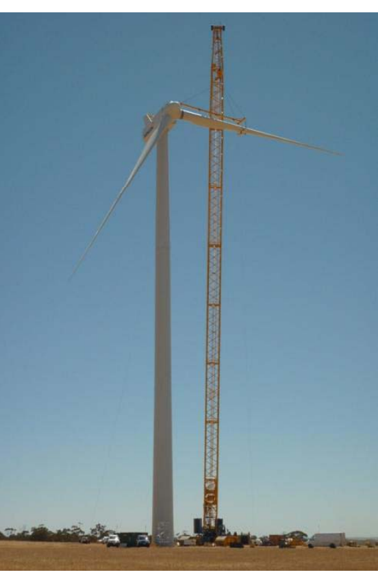
Vestas – Collgar Australia