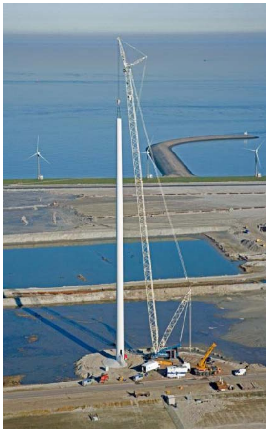
Vestas Benelux Eemshaven V90 (3MW) / 100m